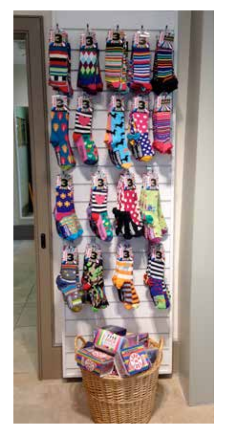
These fun socks come with a pair and a spare - the perfect gift for the man or lady who is forever losing socks!