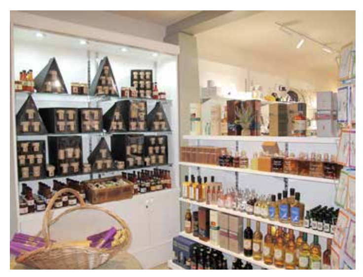
We have a lovely selection of locally sourced food & drink - from shortbread and our own branded chocolate to flavoured gins and a small selection of whisky and beers.