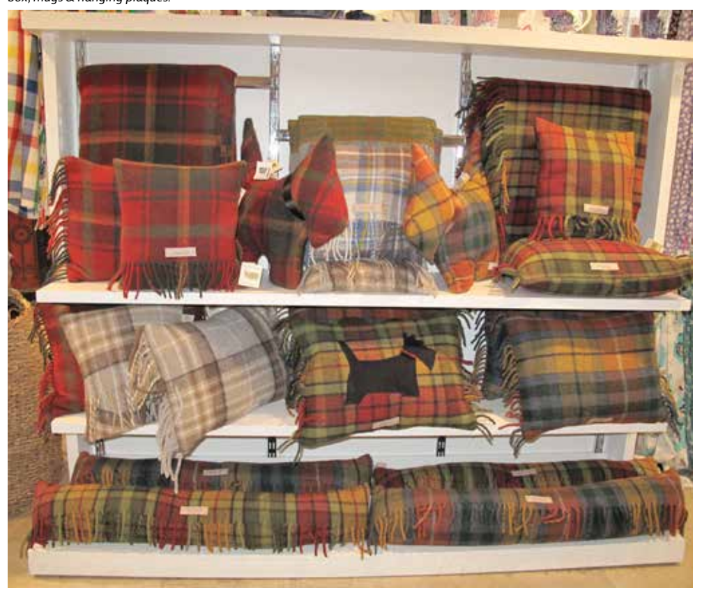
Our Totally Tartans range includes tartan cushions made with authentic Scottish tartans. We also have quirky Scottie dog cushions that make ideal gifts for anyone with a Westie or Scottie dog. We also offer tartan draught excluders and throws that will keep you cosy this winter!